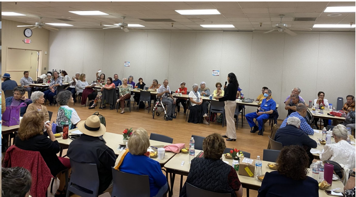
SacRT GO Open House – October 14 th